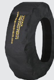
MX Drip bag