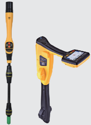
VM-540 and vLoc3-Cam