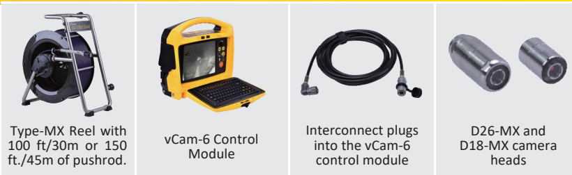
Type-MX Reel with 100 ft/30m or 150 ft./45m of pushrod.

The Type-MX mini-reel can be purchased separately without the control attached to use with the vCam-6 or vCam-5 control modules.