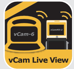
Live View Phone and Tablet App